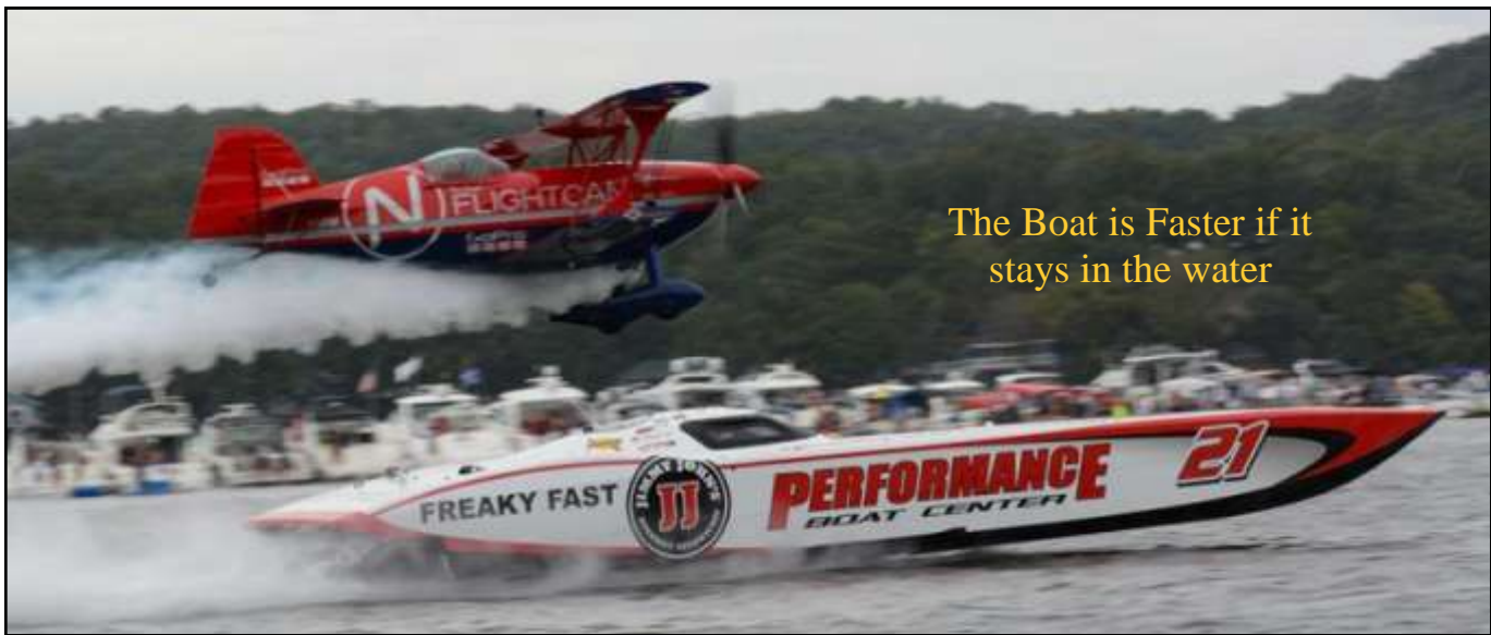
The Boat is Faster if it stays in the water

When you combine Air Shows and Boat Racing, This is what you get!