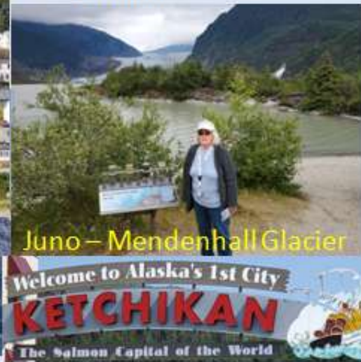
Juno – Mendenhall Glacier

Welcome to Alaska's 1st City KETCHIKAN The Salmon Capital of the World