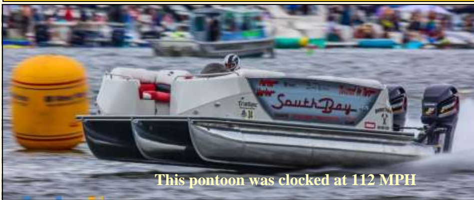
This pontoon was clocked at 112 MPH

Could you imagine spending $117,000 for a pontoon boat and going 112 MPH in it? Well, here are some examples of what you find on Lake of the Ozarks.