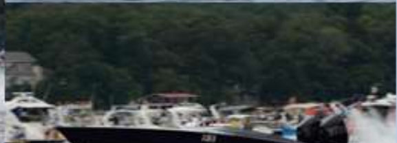
Even an Electric Boat Ran